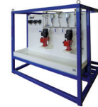
System and process technology